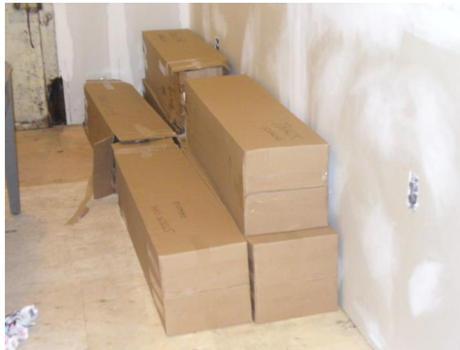
Some of boxes waiting to be unpacked