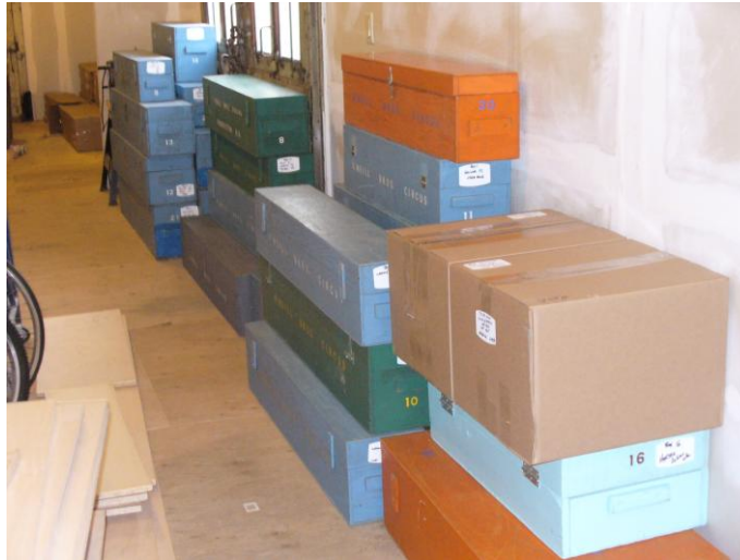
More boxes waiting to be unpacked