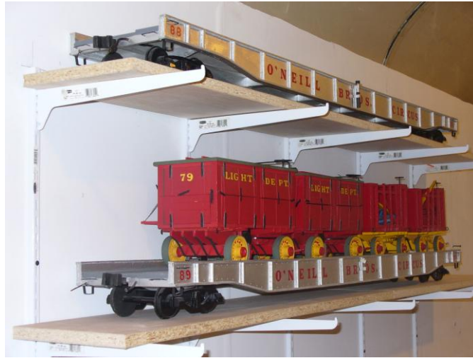
Two of the collection on display

You are being invited to contribute toward the transportation costs. All donations are eligible for tax receipts. Please make sure that donation is marked for Circus Train acquisition in order for your donation to go to this project. Thank you for your contribution.