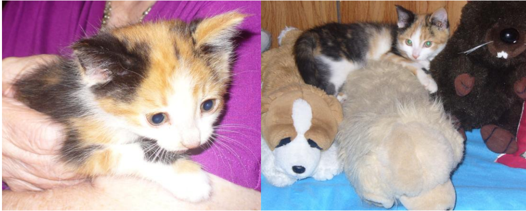
Komoka on Sept 6/14 in her new home