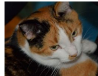
Komoka: Museum mascot

The Museum acknowledges a grant provided by the Municipality of Middlesex Centre