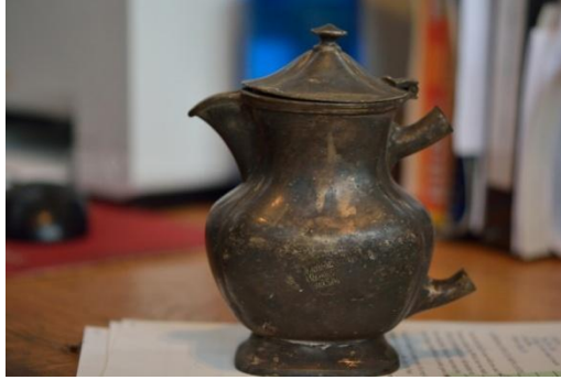
New donation: A silver teapot stamped ``Canadian National Railways`` Handle is missing but still worthy of display.