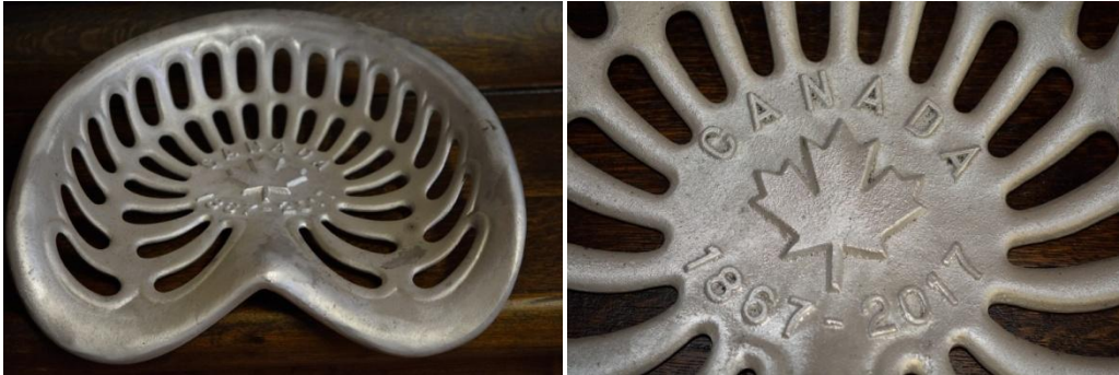
Possible fund raiser with tractor seats for sale with Komoka Railway Museum imprinted. Your comments would be welcome. Samples coming in March 2019.