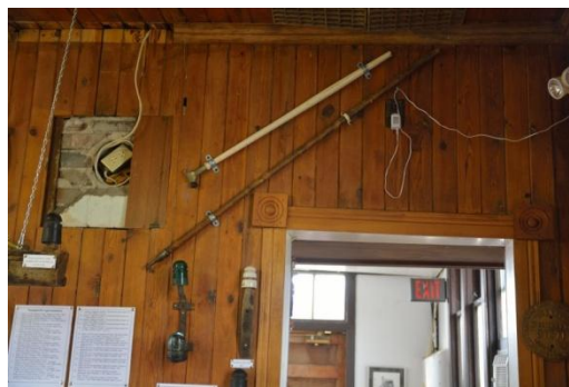
New Display: Two sash closers mounted on wall in station-masters room