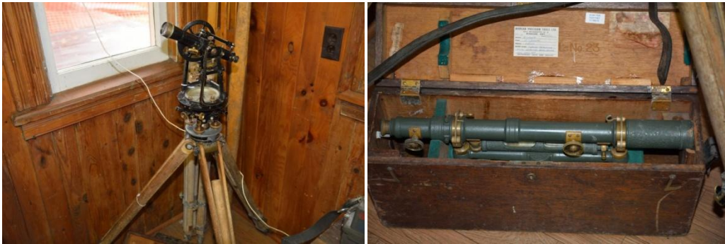
New display: Surveyors equipment. When assembling the various pieces, it was discovered that there are three different transit tripods, two different transits. There is another transit packed away that I noticed the last Saturday in November. Anxious to see what that one looks like next time I am at the museum. Research still needs to be done on these as to dating, manufacturer etc.