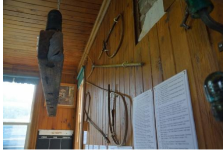
New Display: Four styles of hoops mounted on the wall in the Station-masters room. We have surplus hoops for trade as well.