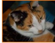
Komoka: Museum mascot

The Ontario Trillium Foundation is an agency Of the Government of Ontario