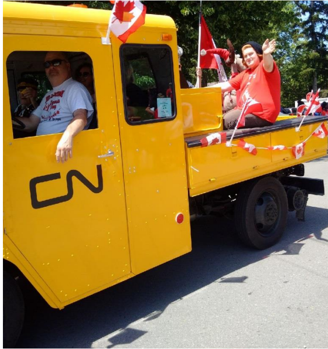
Hi-Railer in Canada Day Parade 2019 at Komoka

Submissions due by July 25, 2019 for August Newsletter