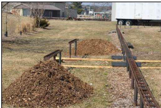
Where some of the chips ended up