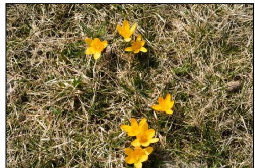
The "Mystery Gardeners" spring display